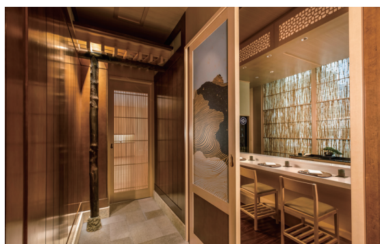
Sushi Ikkon at Crowne Plaza Hong Kong Causeway Bay, Hong Kong

The Group is taking all practicable measures to cope with the challenges. We prioritize in delivering feeling of safety to our guests, putting in place strict sanitisation and hygiene protocol. At the same time, the hotel will strive to implement cost saving measurement and take decisive decision to reduce operating costs in this challenging time to gain further market share. The Group will continue to improve the quality of its hotel services to ensure our guests have enjoyable experiences during their stays in our hotel.