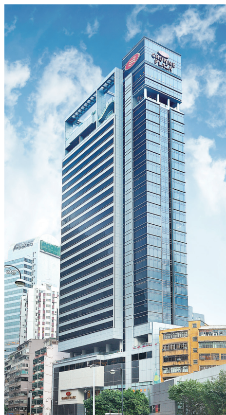
Crowne Plaza Hong Kong Causeway Bay, Hong Kong

The Mainland's outperformance during recovery from the COVID-19 pandemic led the Mainland to be the only major economy with economic growth in 2020. The economy in the first half of 2021 has picked up further. Against the backdrop of tense Sino-US relations, the Mainland economy is likely to continue to progress at a stable pace in the remainder of 2021.