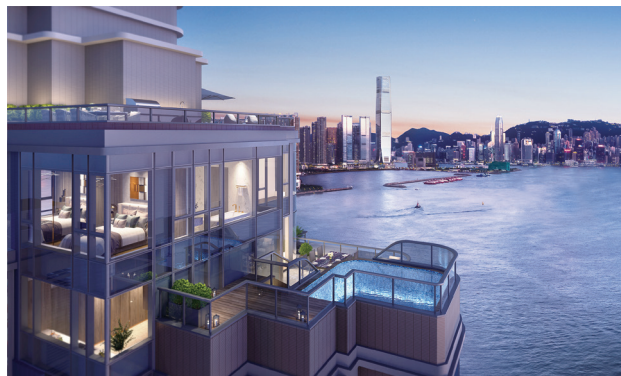
Grand Victoria, Hong Kong

The Group owns 10 houses of residential properties at Shouson Hill Road East. Parts of the renovation works were completed during the period with remaining works to be completed in 2021 by phases. Despite of COVID-19 during the period, the demand for luxury home continues to show resilience amid limited new supply. Subsequent to the financial period end, the Group entered into agreements with several independent third parties to dispose of several houses at an aggregate consideration of approximately HK$670 million (around HK$75,000-HK$92,000 per sq. feet). The transactions will be completed no later than the first quarter of 2022. The disposal provides an attractive opportunity to realise the Group’s investment in the properties and realise a cash amount of approximately HK$420.0 million (after repayment of the existing bank loans) for future reinvestment.