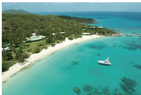
Lizard Island Resort, Queensland

Lizard Island Resort, an Australia's northern-most island resort, uniquely locates on the Great Barrier Reef, 240 kilometres north of Cairns, and has 24 powdery-white beaches, over 1,000 hectares of national park, 40 luxurious beach lodges. Lizard Island has consistently ranked as one of the world's top luxury island resorts. As at 30 June 2021, the property was fully let to a hotel operator on a long-term lease guaranteed by an investment grade conglomerate. The rental income generated from the property for period ended 30 June 2021 was HK$8.7 million (2020: HK$7.4 million).