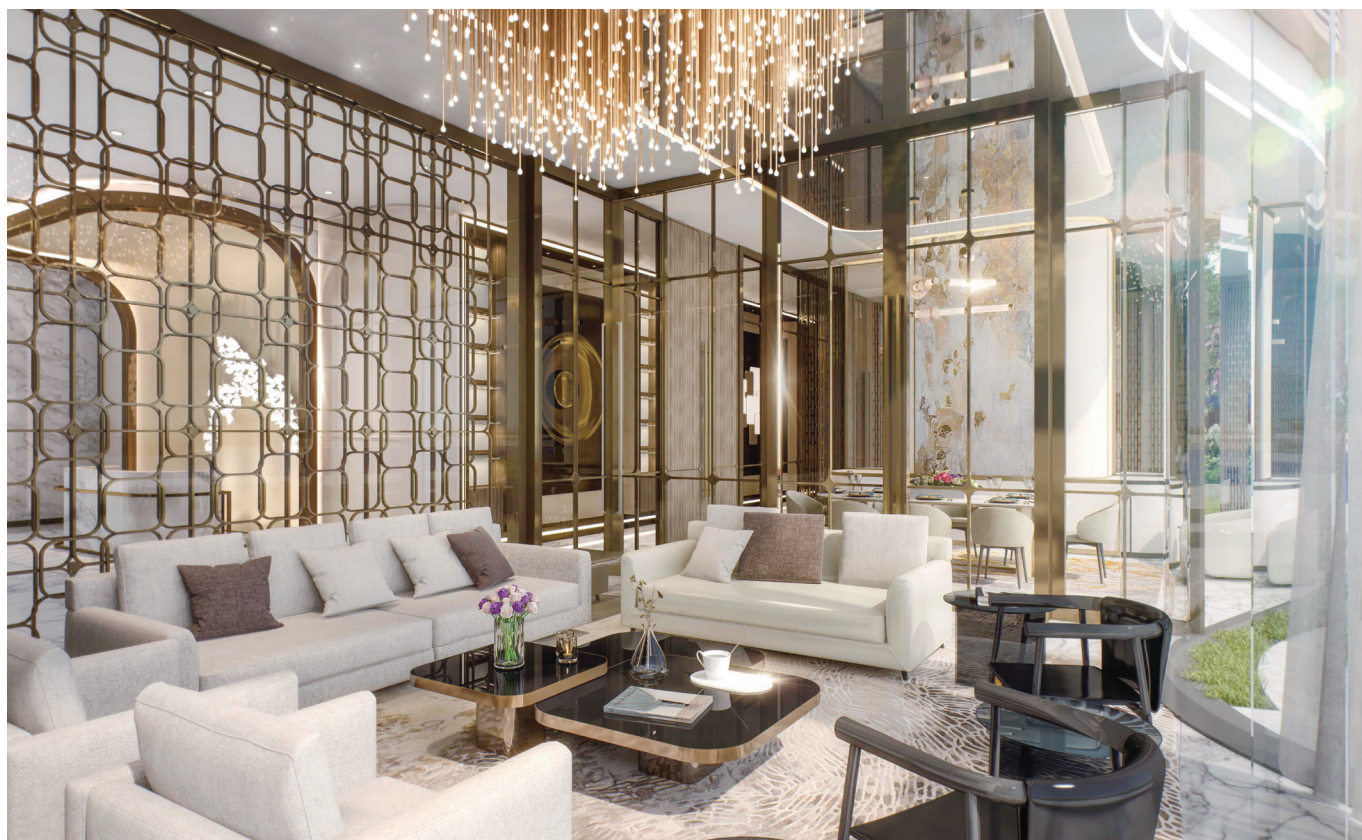
Grand Victoria, Hong Kong