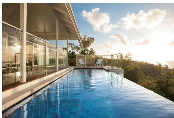
Lizard Island Resort, Queensland

Crowne Plaza Hong Kong Causeway Bay is a 29-storey five-star hotel comprising 263 guest rooms with ancillary facilities and is operated under the brand of Crowne Plaza of the InterContinental Hotels Group. Hong Kong hospitality market continues to be negatively affected by stringent travel restrictions and border closures which have been implemented since March 2020. For the period ended 30 June 2021, the hotel revenue achieved improvement, which was HK$33.6 million (2020: HK$21.4 million), increased by approximately 57%. This was the result from the increase in food and beverage revenue after rebranding of our existing restaurant outlets and introducing new Italian and Japanese restaurants.