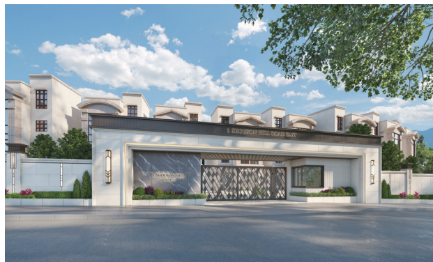
1 Shouson Hill Road East, Hong Kong