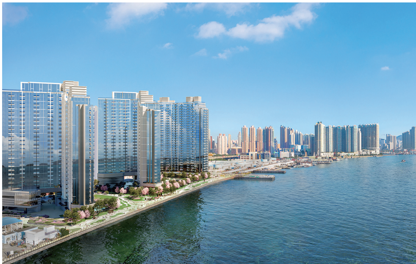
Grand Victoria, Hong Kong