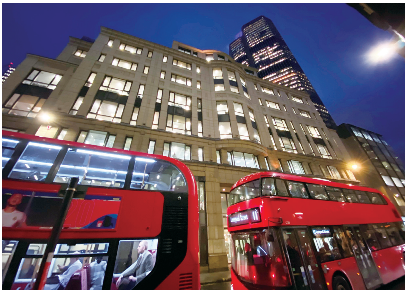
33 Old Broad Street, London